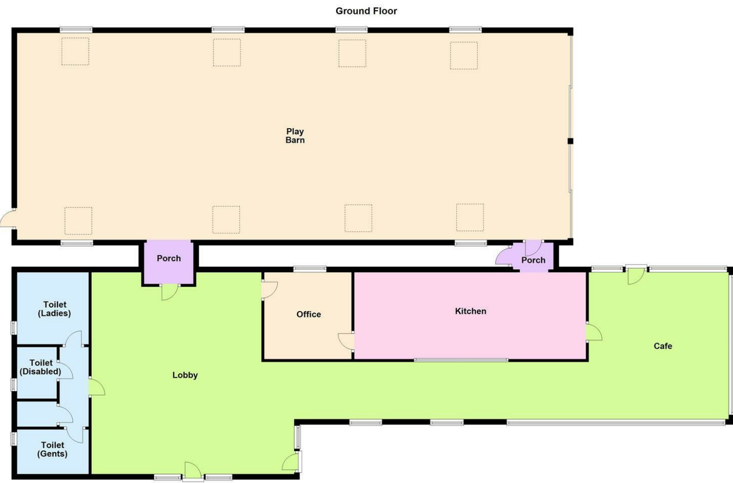
This floor plan has been designed as a visual aid to identify room names and positioning within the building. Some doors, windows or fittings may be incorrectly sized or positioned as these are included for identification purposes only. This is not a working drawing and is not to scale. Plan produced using PlanUp.

GENERAL INFORMATION VIEWING: By appointment only. TENURE: We are advised freehold. SERVICES: We have not checked or tested any of the services or appliances at the property. DRAINAGE: Please note we are advised this property is served by private drainage Business Rate: We are advised that the rateable value of the property is £5200